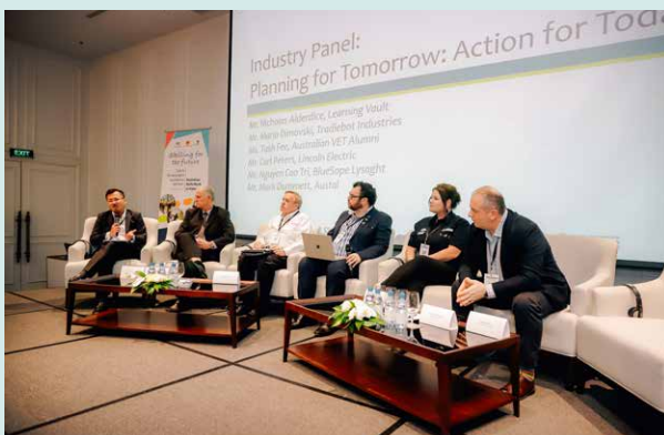
Industry panel at the Australia Vietnam Skills Conference 'Vocational Education and Training for Industry' - 23 October 2019, Ho Chi Minh City.