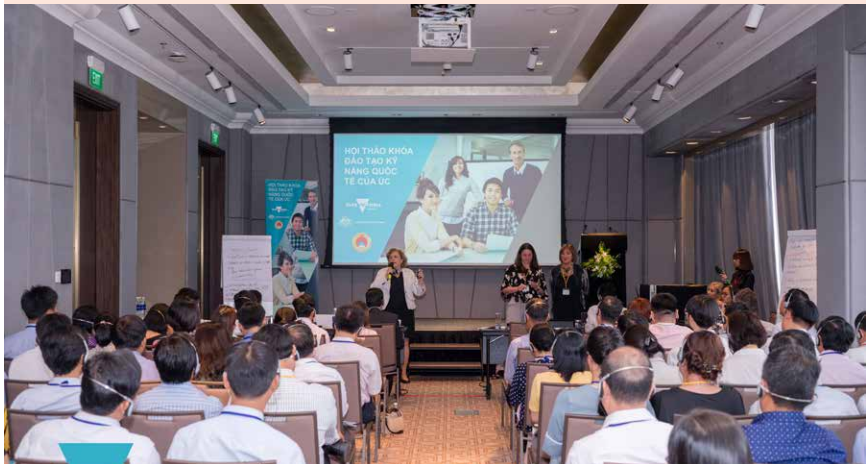
Presenters from the Commonwealth and Victorian governments facilitating the discussion on improving the capacity of VET trainers in competency-based training at the workshop on the International Skills Training courses - 27 August 2019, Ho Chi Minh City.

over 50 vocational institutions in HCMC at a workshop in August 2019. Representatives from four Victorian TAFEs explained how the IST courses can provide a cost-effective option to upskill HCMC’s 12,000 vocational teachers in competency-based training.