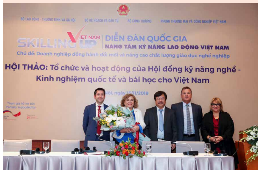
Representatives from the Governments of Australia and Vietnam co-launching the Industry Skills Board pilot project at National Forum 'Skilling up Vietnam' - 15 November 2019, Hanoi.

Vietnam in November 2019, the ISB pilot project in the tourism and hospitality sector will look to undertake a skills audit and skills forecast for this priority sector, with technical assistance from Australian VET experts. In the long term, the ISB is expected to inform national VET policy direction for the Government of Vietnam on how to engage with industry to develop national VET qualifications that meet the needs of industry, providing industry-relevant training for learners.