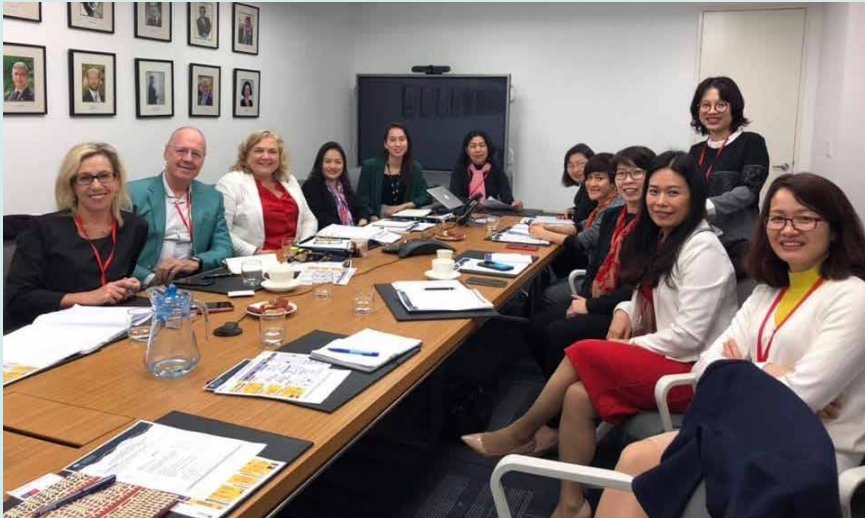
Members attending the 10 th meeting of the Australian Education in Vietnam Advisory Group at the Australian Embassy - 12 February 2020, Hanoi.

The Advisory Group's 11 th meeting, on the other hand, was an exemplar of how key players in the sector can come together on an open platform to share their insights and best practice in the face of a crisis such as COVID-19. Being aware of the pressure faced by Australian companies and investors overseas posed by the Coronavirus, the Advisory Group members reconvened earlier than expected to update each other on the impact of COVID-19 on their ability to conduct business and how recent changes in policy affected delivery, both onshore and offshore. Austrade and DESE teams in Vietnam have been actively reaching out to key government and sectoral