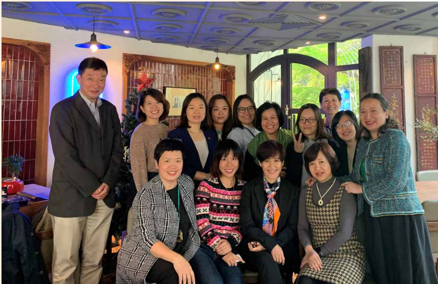
6 th International Education Workshop on 13 December 2019 in Hanoi with counterparts representing UK, USA, Canada, New Zealand, Japan, Ireland and EU.

In 2017, Austrade Vietnam initiated the bi-annual international education workshops for representatives from countries and regions who actively promote international education in Vietnam to come together and share regular updates on recruitment trends, relevant events, regulations and partnerships. Regular members of the platform include Austrade's counterparts from the United Kingdom, the United States, Canada, New Zealand, Japan, Ireland, and the European Union, who share the common goal of growing the international education market in Vietnam together.