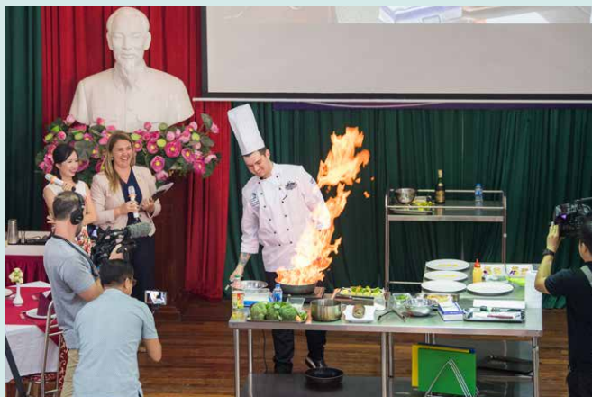
Australia’s VET Alumni and WorldSkills Australia competitors sharing their skills and passion with fellow Vietnamese VET teachers and students during the inaugural Australian Skills Week in Vietnam - 21-24 October 2019, Hanoi and Ho Chi Minh City.