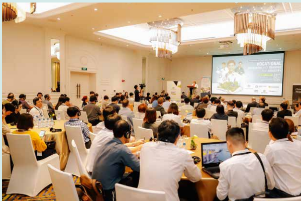
Australia Vietnam Skills Conference 'Vocational Education and Training for Industry' - 23 October 2019, Ho Chi Minh City.