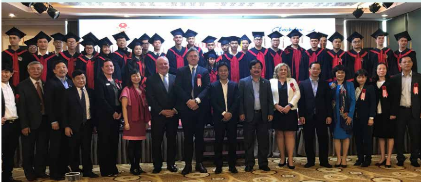
Australian qualification presentation and graduation ceremony for students graduating from refrigeration and air conditioning engineering course at diploma level under the AQF trial delivery in Vietnam - 14 January 2020, Hanoi.

awarded an AQF qualification. The Government of Vietnam is exploring the potential to scale up the delivery of AQF qualifications to prospective students in Vietnam, in partnership with Australian vocational education and training providers.