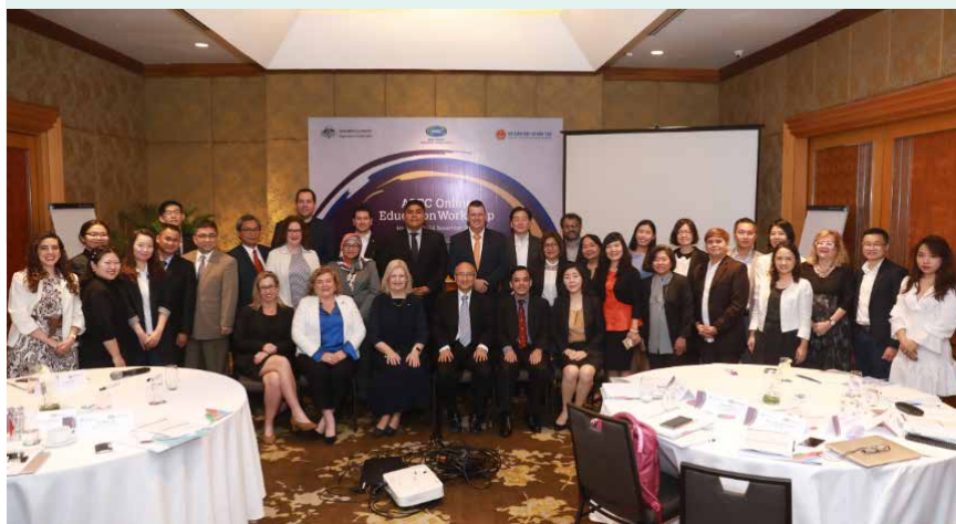
Participants from 14 APEC economies attending the APEC Regional Workshop on Online Education - 12-14 November 2019, Hanoi.

gained a better understanding of the toolkit's application, felt more confident about quality assuring online learning and the development of policies and practices to apply the Toolkit in their home countries. The APEC Quality Assurance of Online Learning Toolkit was developed and finalised in September 2017 through a series of workshops involving APEC economies working together to consider how best to quality assure online education. Timely and effective application of the Toolkit across APEC economies will help open tremendous opportunities for collaboration in online higher education delivery with Australian providers.